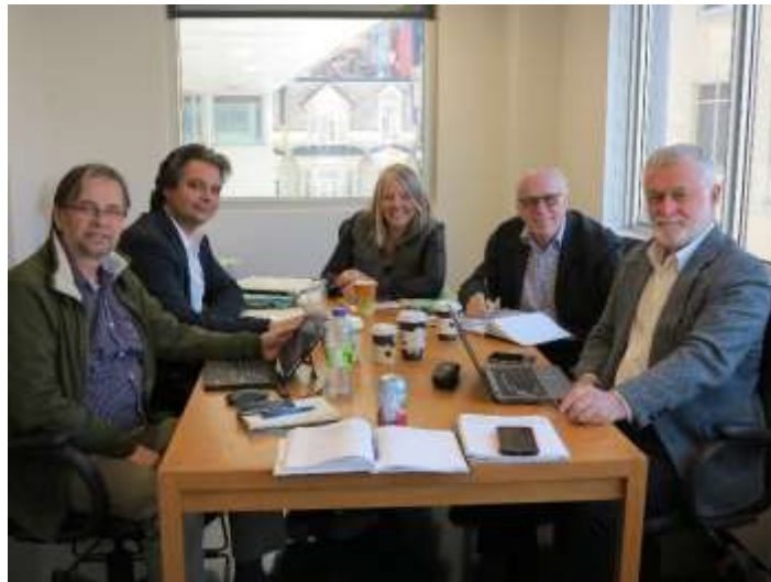
Figure 1: COMEX members at one of their meetings