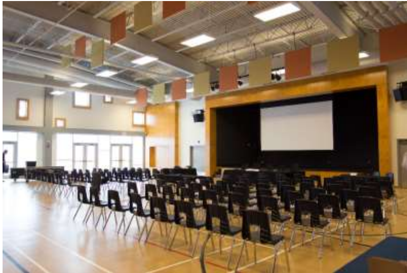
Figure 2: Getting ready for a public hearing

information and consultation sessions in a community, at a designated time, to solicit views and opinions on a new project or changes to an existing one. The consultation stage is an opportunity for the public, the project proponent and the Review Committee members to share information and discuss the project. All COMEX hearings are public. Sound recordings and written submissions made during public hearings are posted on the COMEX website. In accordance with the Directive on Public Participation, “The Review Committee determines whether a public hearing is needed after taking into account the social and environmental impacts of a project, initiatives undertaken by the proponent, and the comments and concerns it hears during the consultation process.”