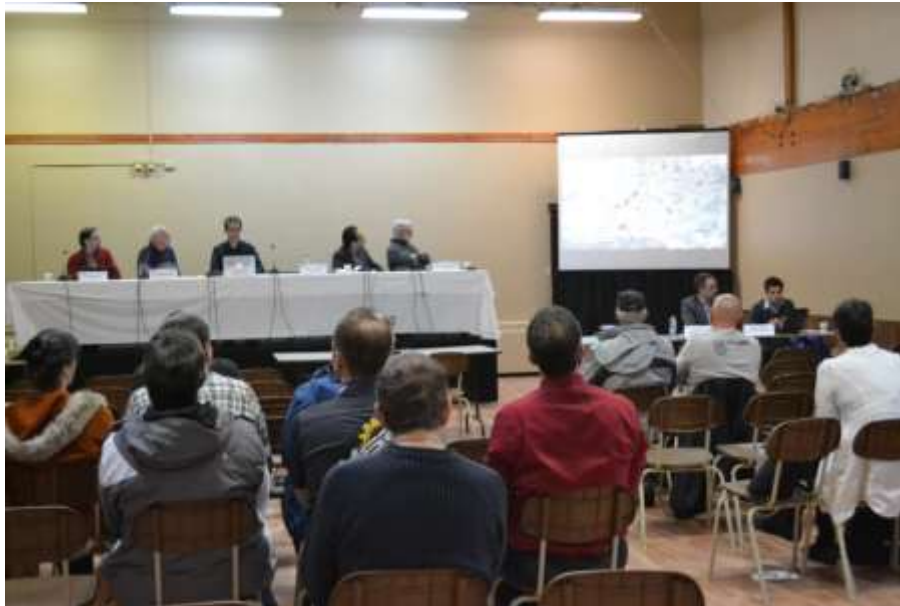
Figure 3: Public hearing held in Waswanipi

The Review Committee sent its recommendation on the project to the Provincial Administrator on March 24, 2016.