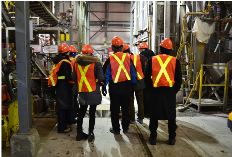
Figure 1. Members of the Review Committee on a site visit to the Éléonore mine.