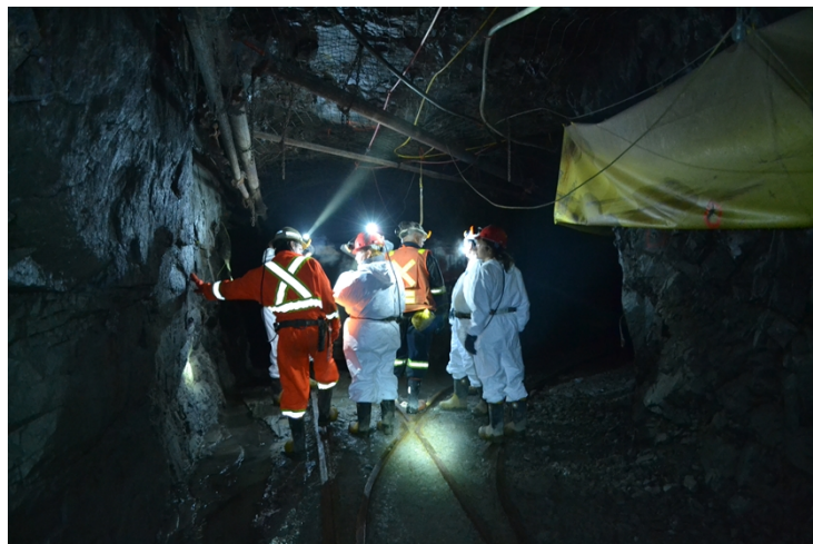
Members of the review committee on a visit to the Bachelor Mine.