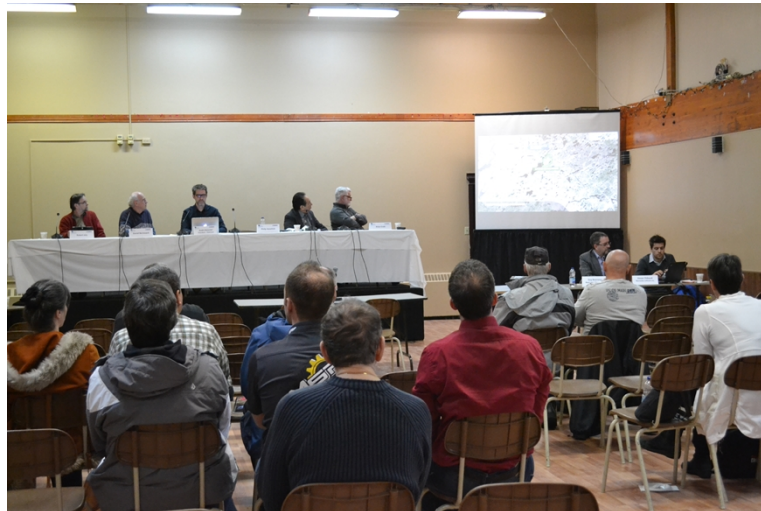
Figure 2 : Public hearing held by the Review Committee in Chibougamau.

The Review Committee conducted the second public consultation in order to ascertain the views and concerns of the communities affected by the proposed development and operation of a spodumene deposit in the James Bay Territory (the Whabouchi project). The consultation was launched February 16, 2015 with a press release on CNW and all the project documentation was published on the COMEX website. In addition, two public hearings were held in Nemaska and Chibougamau on March 30 and April 1, 2015 respectively; the public at large were also invited to send their written comments to the Review Committee before April 30, 2015. A decision on the Whabouchi mine project is expected during the 2015-2016 fiscal year.