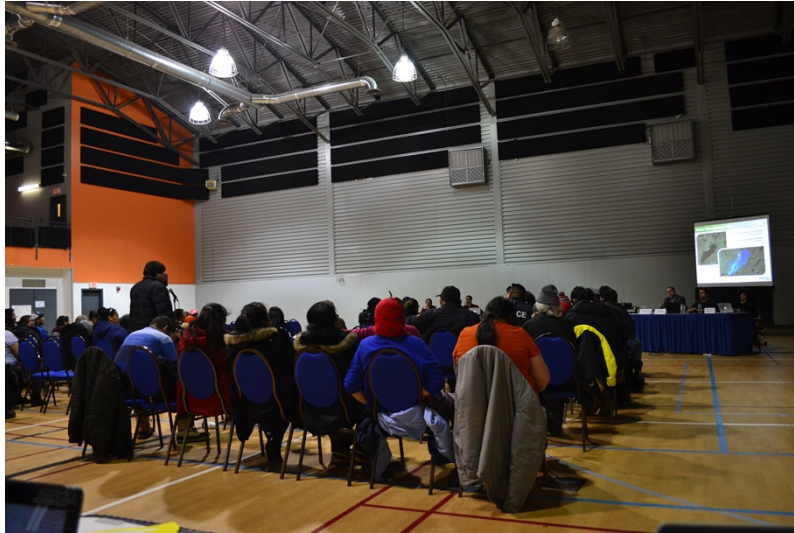
Figure 1 : Public hearing of the Review Committee in Nemaska.

Finally, the hearing process consists of information and consultation meeting, held in a community at a designated time, to obtain views and opinions on a new project or a modification to an existing one. This step includes exchanges between the public, the project proponent, and the members of the Review Committee. All COMEX hearings are public. According to the Directive on public participation , it is “the Review Committee [that] determines whether a public hearing is needed after taking into account the social and environmental impacts of a project, initiatives undertaken by the proponent, and the comments and concerns it hears during the consultation process.”