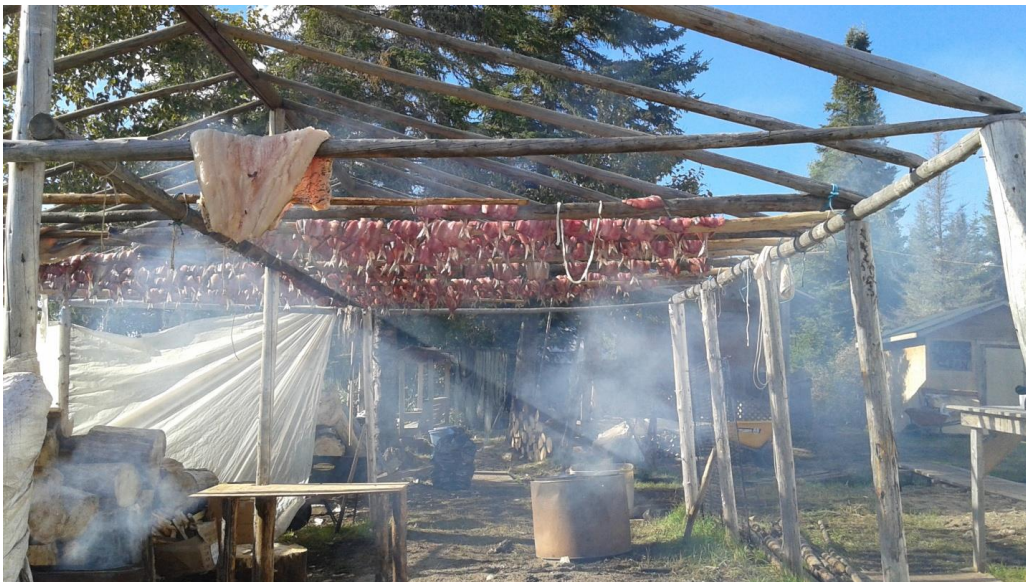
Figure 2 Smoking whitefish caught at the traditional fishing site at Smokey Hill, Waskaganish