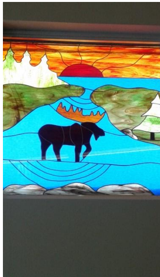
Figure 3 Stained-glass window in the Band Council room, Waswanipi

The Review Committee did not hold any public consultations in 2016-2017.